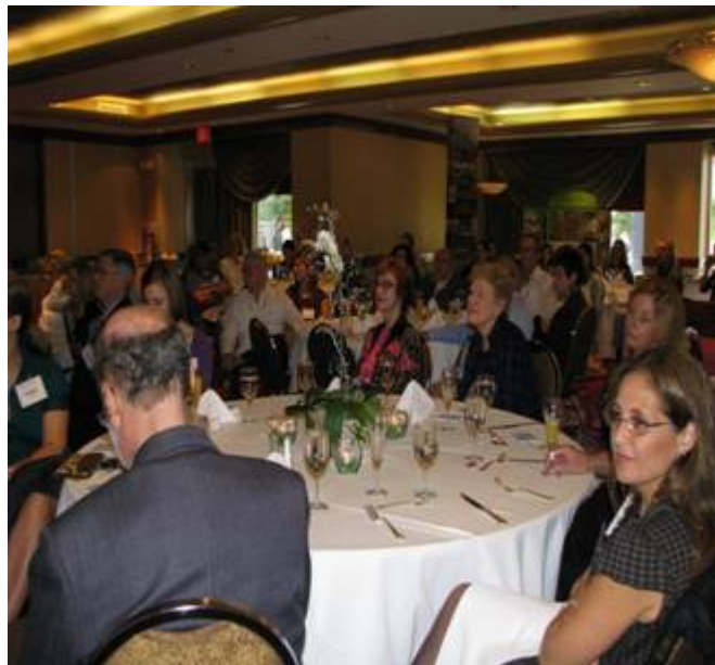
DCPA Holiday Brunch & Workshop